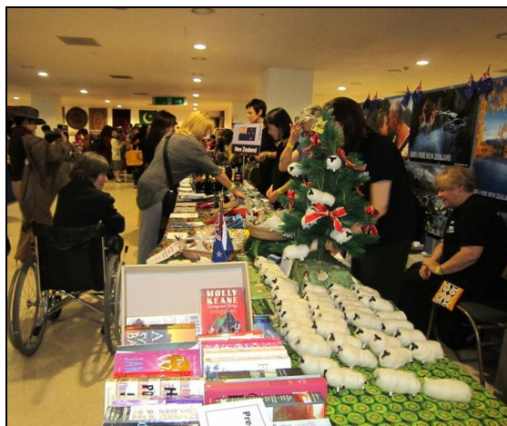
New Zealand items including wine, merino/possum/silk gloves and scarves, honey, wool sheep decorations were popular at the bazaar.