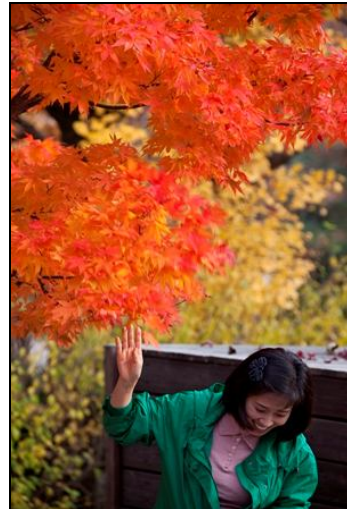
Autumn in Korea

BILATERAL POLITICAL AND ECONOMIC UPDATES