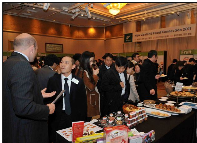
Over 230 Korean food and beverage industry professionals attended the second New Zealand Food Connection in Seoul on 15 November.

NZTE Seoul held the second New Zealand Food Connection at the Plaza Hotel in Seoul on 15 November, building on the success of three previous events in Korea. It was another huge success, showcasing the best New Zealand food and beverage products to over 230 Korean food and beverage industry professionals.