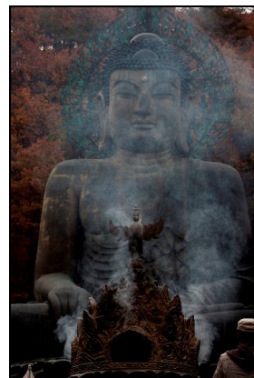
Buddha and incense

Jeong Dong Building, Level 8 (West Tower) 15-5 Jeong-dong, Jung-gu Seoul 100-784, Republic of Korea KPO Box 2258, SEOUL 110-110 Telephone 82-2-3701-7700; Fax 82-2-3701-7701 Website: www.nzembassy.com/korea ; E-mail: nzembse1@kornet.net