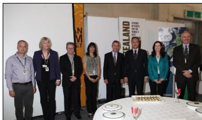
New Zealand BIFCOM participants and officials of the Embassy.