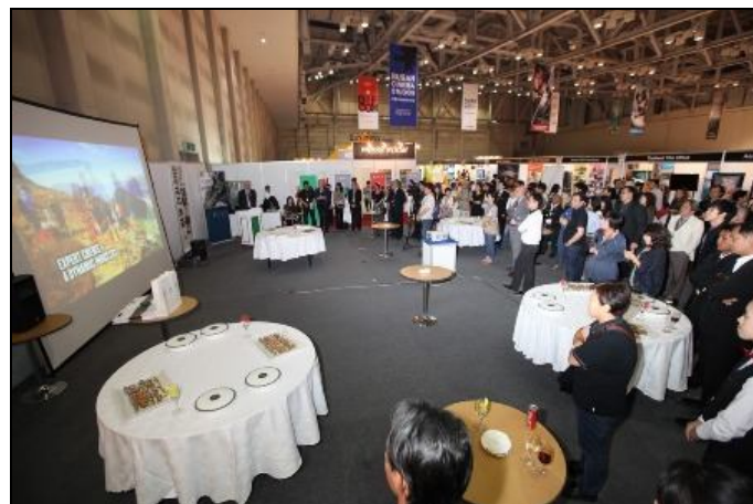
Korean and New Zealand film industry people attended a New Zealand film networking reception.