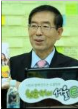
Seoul Mayor Park Won-soon

mayoral race, garnered 46.2%. The voter turnout was 48.6%, higher than most by-elections.