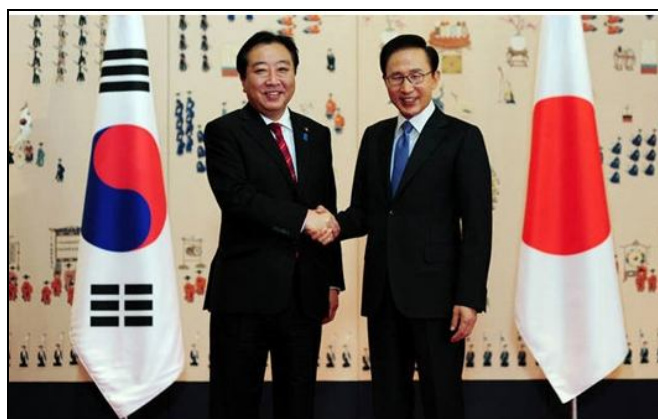
President Lee Myung-bak and Prime Minister Yoshihiko Noda had a summit meeting on 19 October.

On 19 October President Lee Myung-bak and Prime Minister Yoshihiko Noda had a summit meeting at the Blue House in Seoul. The two leaders agreed to expand the won-yen currency swap scheme to US$70 billion from US$13 billion for stronger financial cooperation amidst global economic uncertainties. President Lee and Prime Minister Noda also agreed to resume working-level talks to resume stalled negotiations on a free trade pact. Prime Minister Noda emphasised the need for an FTA during his breakfast meeting with a group of Korean and Japanese lawmakers, saying that voices against the FTA should be overcome by political decisions. The two leaders also agreed to bolster cooperation on North Korea's denuclearisation efforts and expand bilateral cultural exchanges.