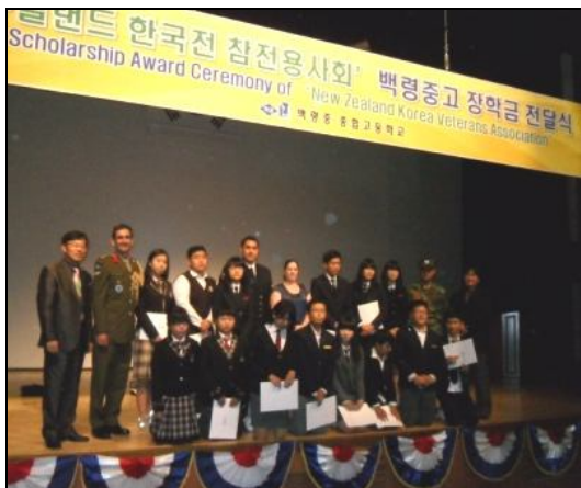
Scholarship presenters and recipients.