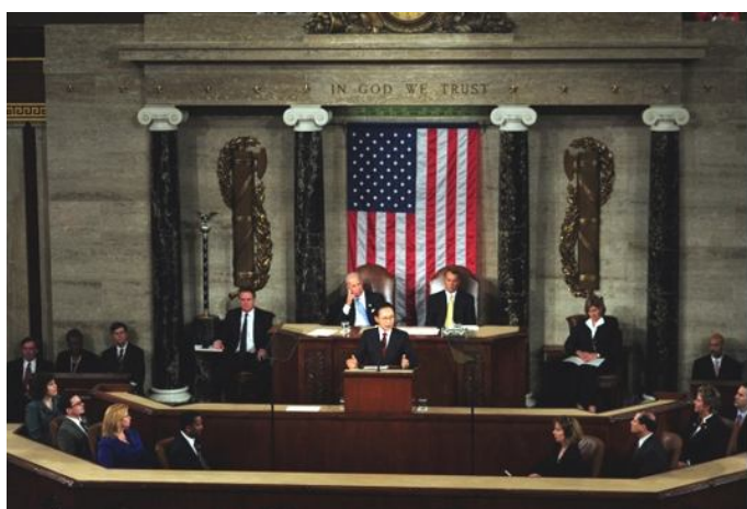
President Lee Myung-bak delivered an address at a joint session of the US Congress.

On 13 October Presidents Lee Myung-bak and Barack Obama had a summit meeting at the White House in Washington and agreed to increase the scope of the bilateral alliance. The summit focused on the ratification of the Korea-US Free Trade Agreement (KORUS FTA) and how to deter North Korean aggression.