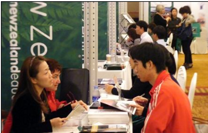
The New Zealand Education Fair attracted over 1,100 visitors.

Air New Zealand, Zespri, SK Telink, and five education agents sponsored the fair. Education New Zealand received almost 1,400 online registrations in the weeks leading up to the fair, an increase of around 20% compared to the 2010 fair registrations.