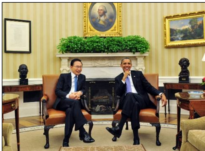
President Lee Myung-bak and President Barack Obama had a summit meeting on 13 October.