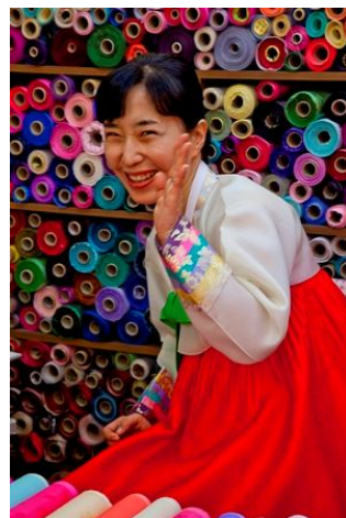
Colourful greetings from a Korean traditional costume “hanbok” fabric shop